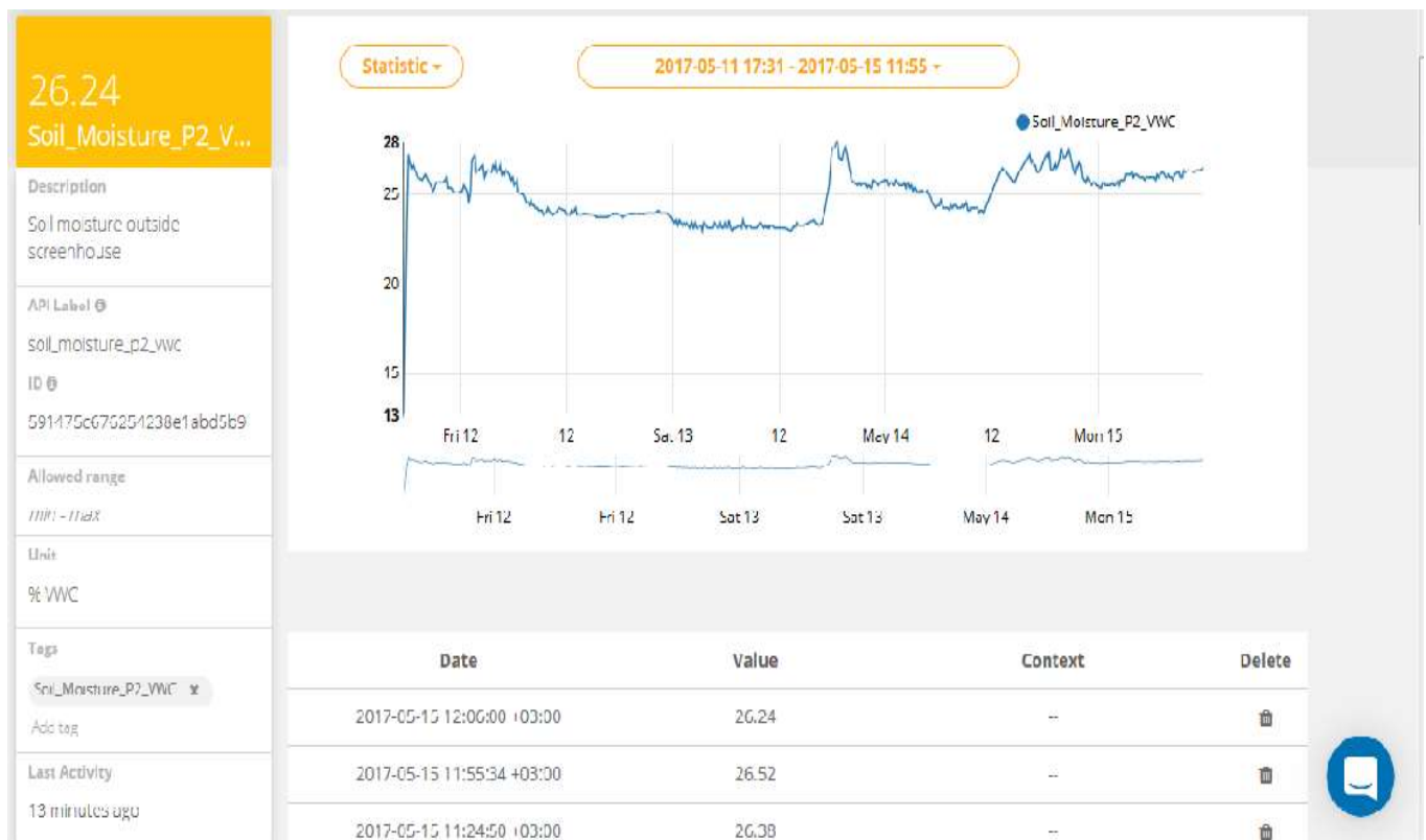
Screenshot of the data stream showing soil moisture trend outside a screen-house.